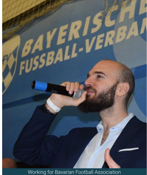
Working for Bavarian Football Association

Getting the most out of the event with teamwork and making my contribution with a unique moderation is what matters to me. Moderate in a qualitatively valuable way. For your trade fair.