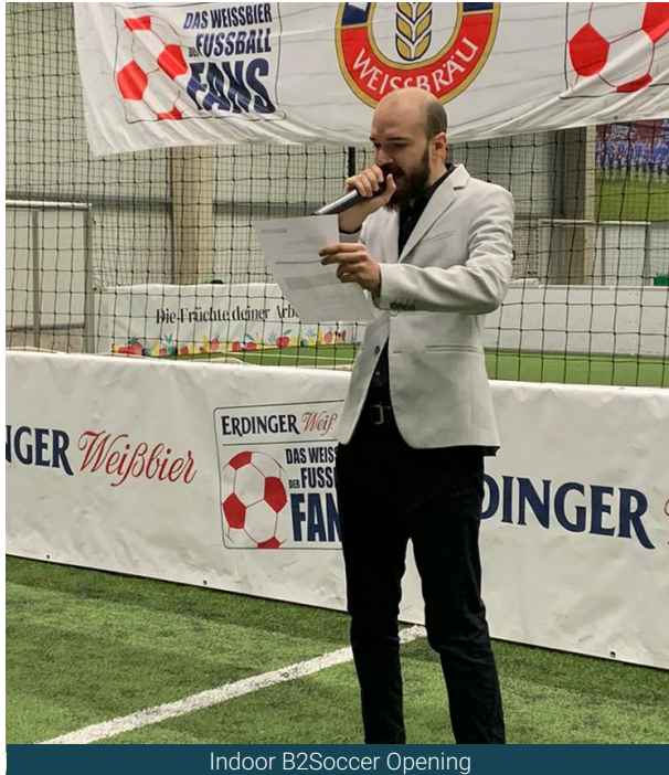
Indoor B2Soccer Opening